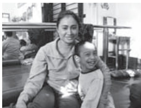
A staff member plays with a child at "Ban Sainesouk Center," a care center for children with disabilities (March 2013)