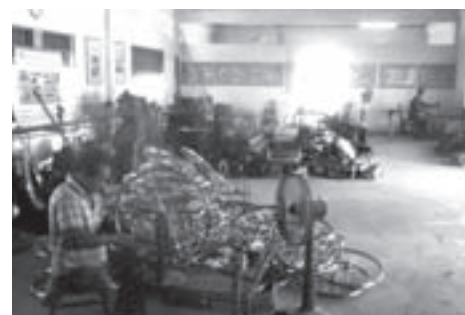
The wheelchair production workshop has become self-sufficient in creating and repairing wheelchairs (May 2013)