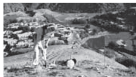
A HALO Trust worker clears landmines (June 2012)

Beneficiaries: 300 households living in target area