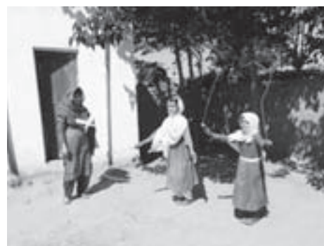
A teacher (left) leads the children in a physical education activity using the jump ropes provided by AAR Japan (October 2012)

Beneficiaries: 11,000 students and 200 teachers in schools in Afghanistan refugee camps