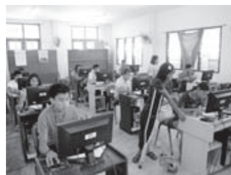
The computer course of the vocational training center was able to increase the number of trainees following the extension and renovation of the classroom (December 2012)