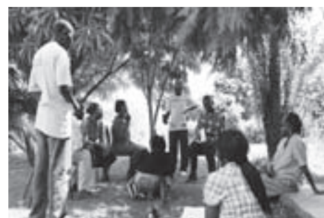
Volunteers for medical assistance discuss about effective methods on how to continue ART support (March 2013)

Beneficiaries: Direct beneficiaries: approximately 18,620 individuals for the first term (ART patients, their family members, and volunteers for medical assistance) Indirect beneficiaries: 59,000 individuals (residents of the target area)