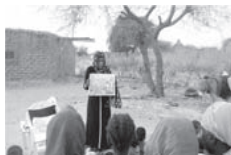
Mine risk education is performed using picture slides (December 2012)