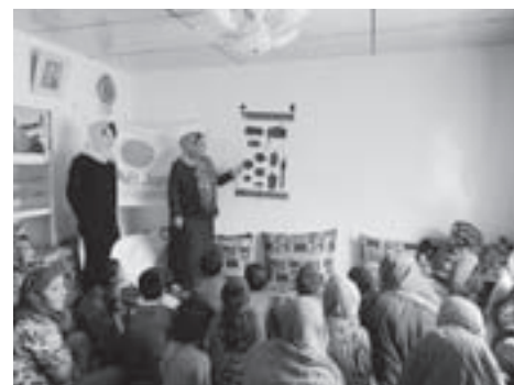
A female staff member of AAR Japan's Kabul Office leads a MRE session for adult women (right, September 2012)