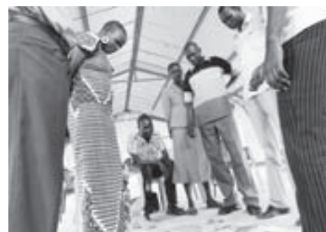
A lecture on health promotion is given to teachers in an elementary school. Using the knowledge they acquired from the lecture, the teachers will then educate the children about hygiene control (July 2012)